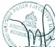
ON BEHALF OF THE MARITIME ADMINISTRATION OF HONDURAS